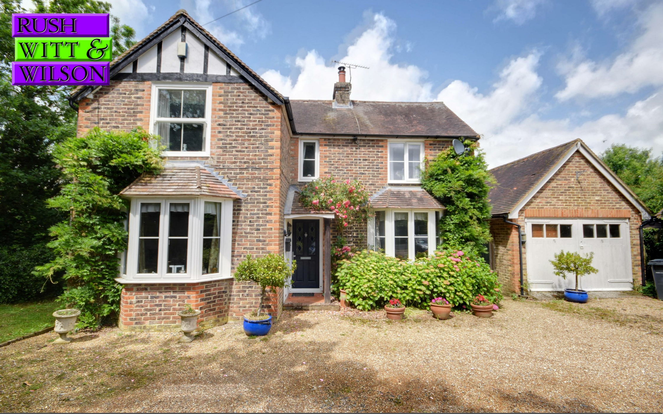
Boarswood Cottage, Barnets Hill, Peasmarsh, East Sussex, TN31 6YJ. £669,000 GUIDELINE